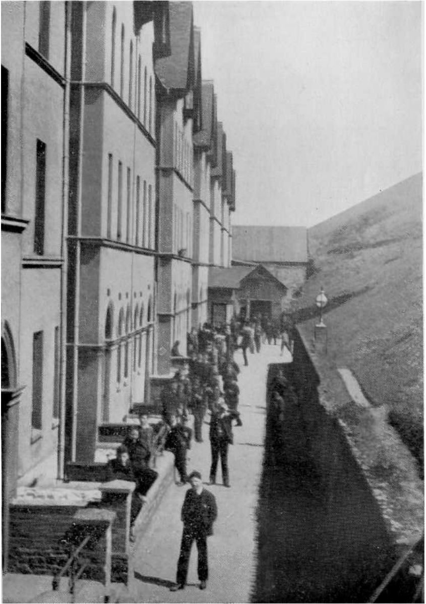
U.S.C. WESTWARD HO ! IN 1880.